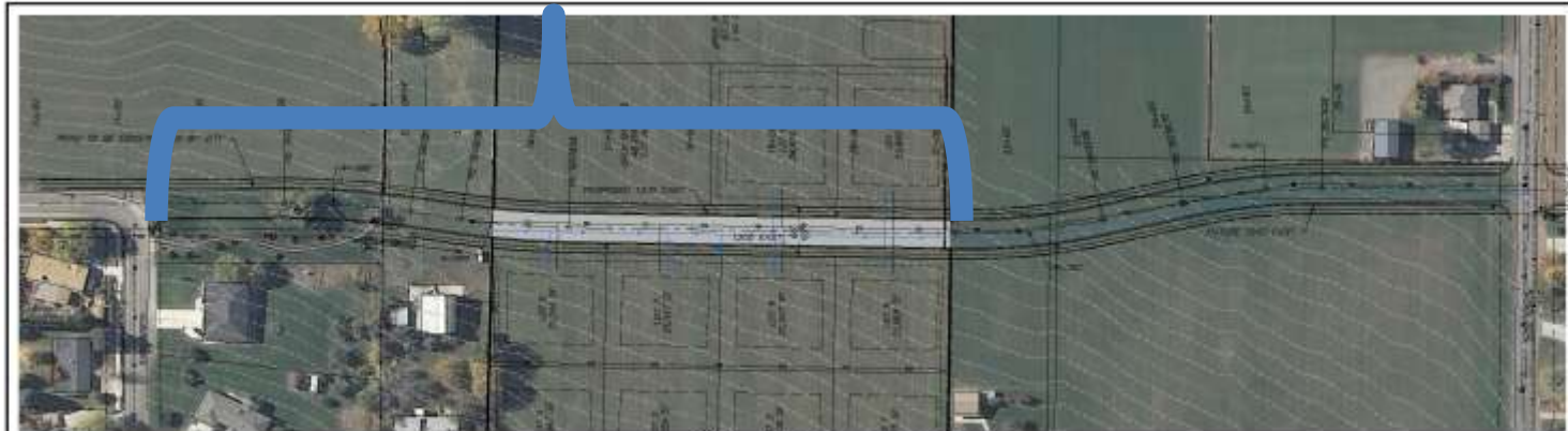
PROPOSED/FUTURE 1200 EAST SCALE: 1" = 80'