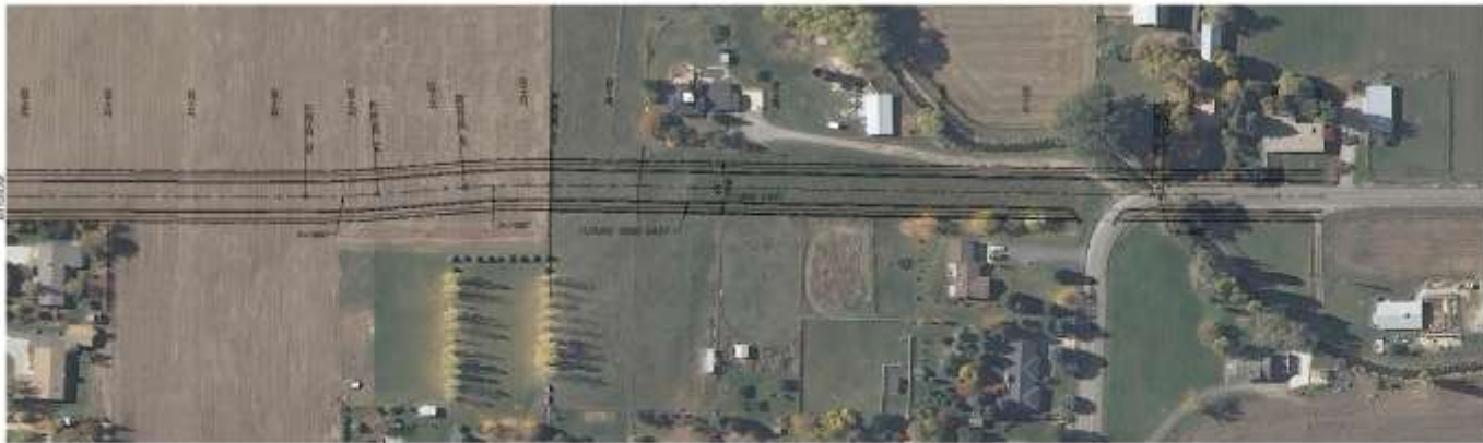
FUTURE 1200 EAST SCALE: 1" = 80'